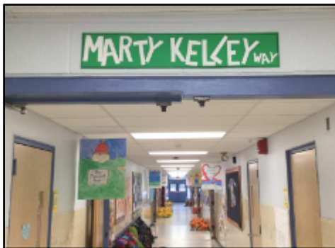
Rename school hallways.