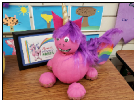
Make student art projects.