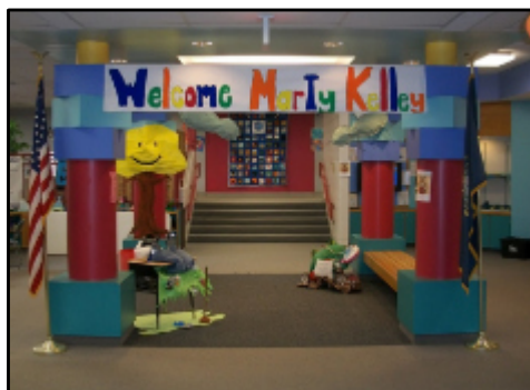
Decorate your lobby.

It sounds simple, but I have visited schools only to find that the students had no idea who I was or why I was at their school.