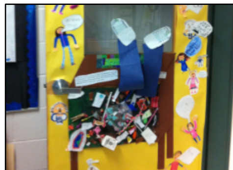
Decorate classroom doors.