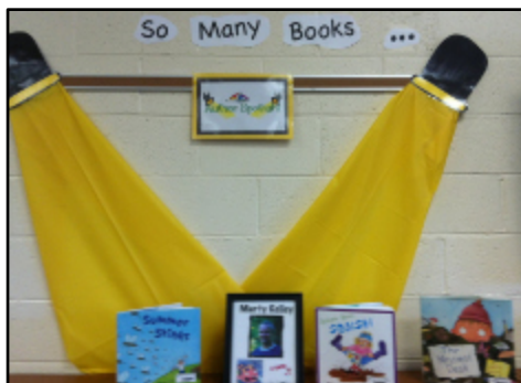
Library author spotlight.