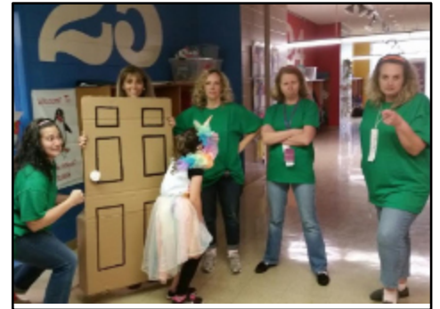
Write a play based on a book.