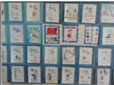
Write new versions of the author's books.