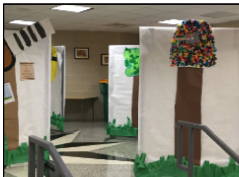
Make new art for a book.