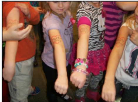
Tattoo your students!