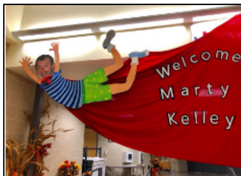
Make a hall display.