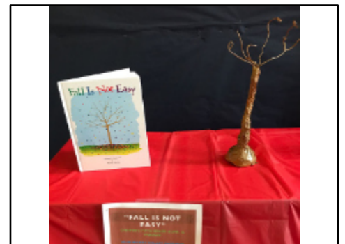
Book-based science experiments.

The more you put into an author presentation, the more your students will benefit.