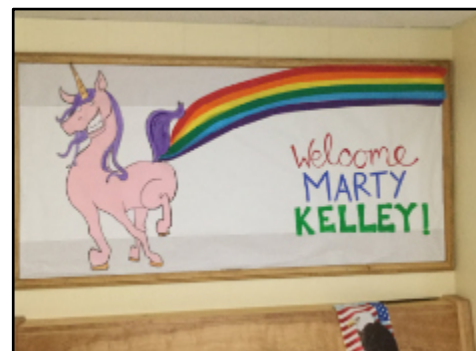
Create a bulletin board.