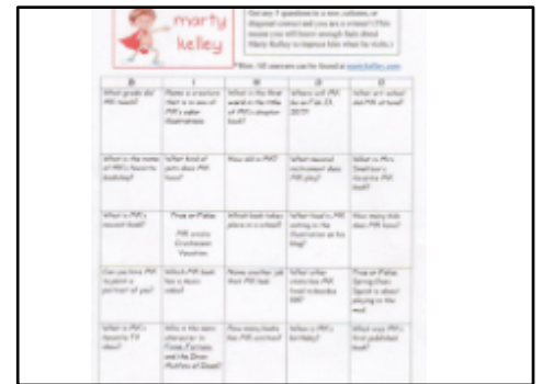
Author website bingo.