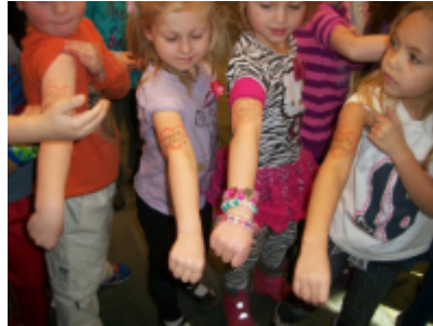
Tattoo your students!