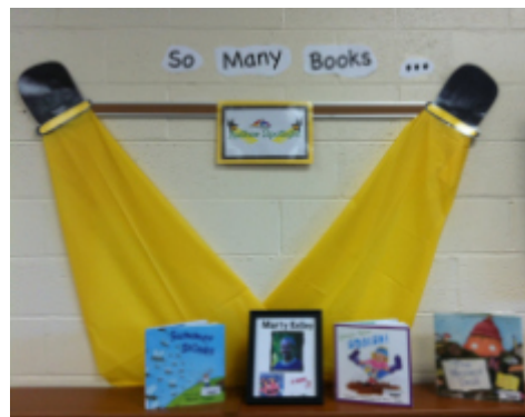
Make an author spotlight.