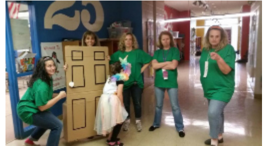
Write a class play based on a book!