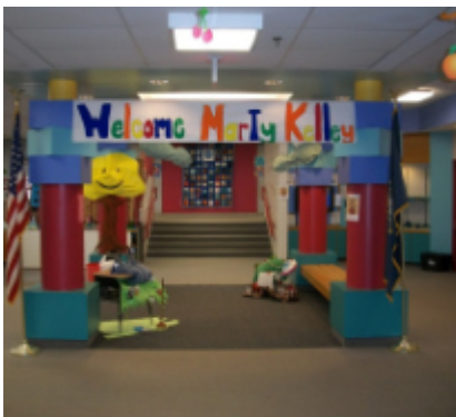
Decorate your lobby.

It sounds simple, but I have visited schools only to find that the students had no idea who I was or why I was at their school.