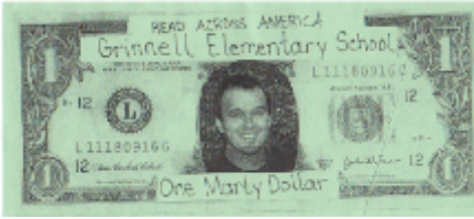
Make author bucks!

Teachers and students are amazingly creative. Include art, music, and PE classes! •Involve specials: make music, create P.E. Games, make art, do a science experiment, write your own math problems, create food based on the author's books. Here are some ingenious ideas to get you started.