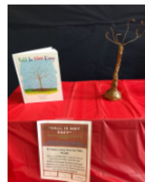
Make science experiments based on the books!

The more you put into an author presentation, the more your students will benefit.