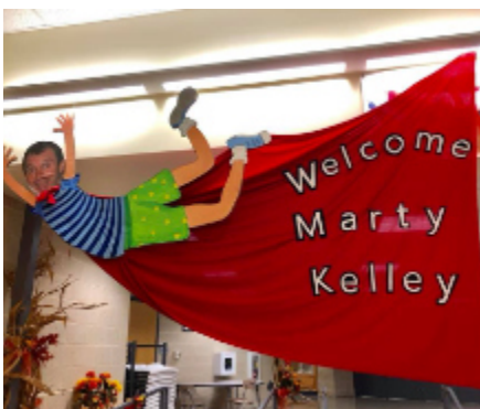
Make a hallway display.