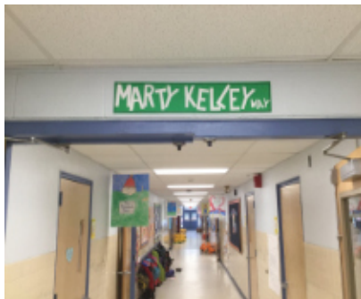
Name school hallways after the author!