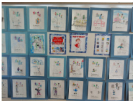
Write new versions of the author's books!