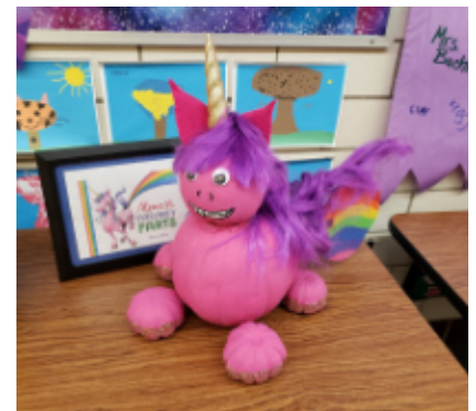
Create masterpieces in art class.