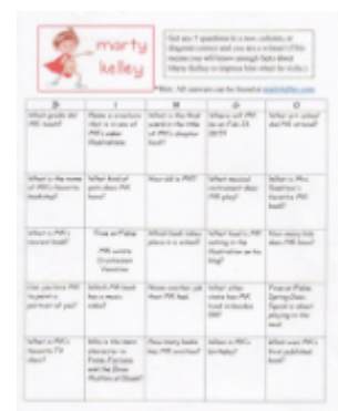
Author website bingo!