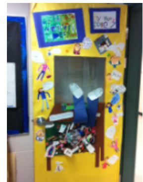
Decorate classroom doors!