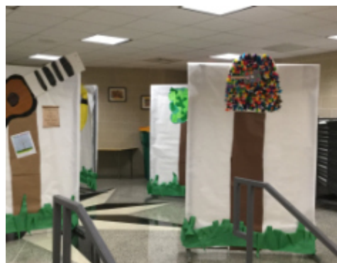
Create huge new art for the book!