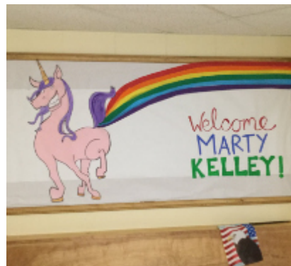
Make a bulletin board.