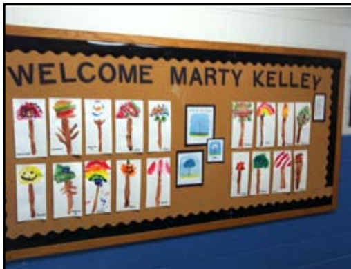
Make a bulletin board.

It sounds simple, but I have visited schools only to find that the students had no idea who I was or why I was at their school.