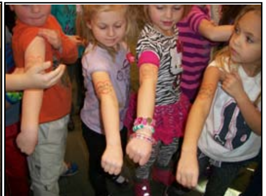
Tattoo your students!