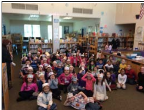
Make class hats.