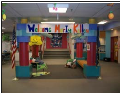
Decorate your lobby.