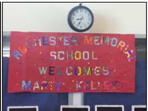
Make a banner in art class.