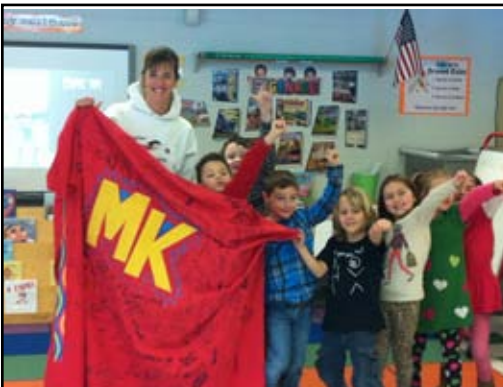
Make a costume for the author.