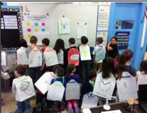
Write a class play based on a book.