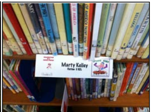
Make library shelf tags.