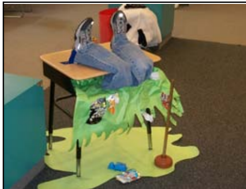
Make tiny desk sculptures