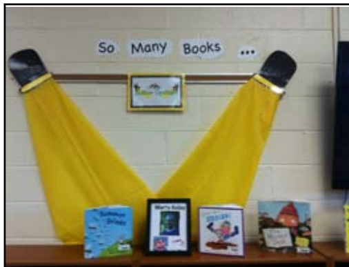
Make an author spotlight.