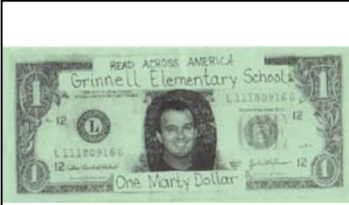
Make author bucks.

Here are some ingenious ideas to get you started.