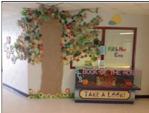
Make a display in the hall.