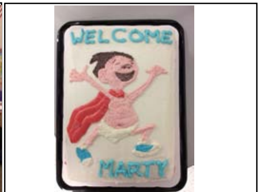
Bake a cake!