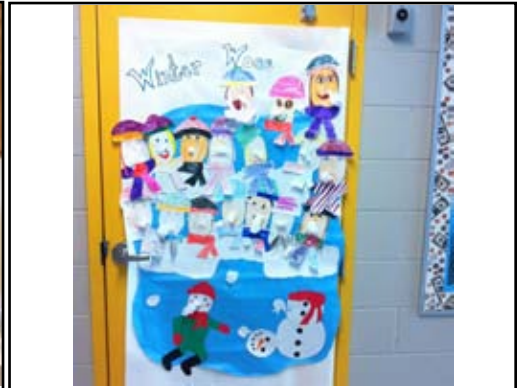
Decorate classroom doors.